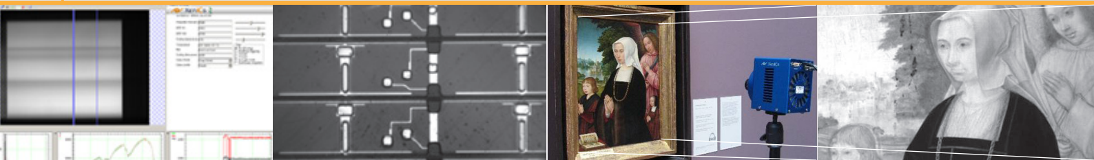
⌘ Spectral signature PVC