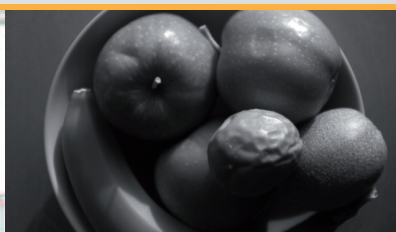
⌘ Food inspection