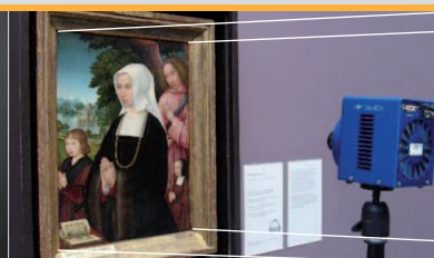
⌘ Art inspection